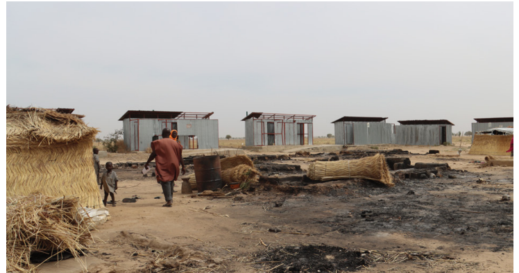
Aftermath of the fire outbreak at Muna el badawy camp Jere LGA.

On 3 and 6 March 2023, fire outbreaks were reported in Muna El Badawy camp in Jere LGA in Borno State. A total of 1,675 individuals were affected by the fire outbreaks as a total of 16 shelters were damaged and destroyed. The affected population include 834 children, 538 women and 303 men. Most of the affected people lost their personal belongings to the fire, including biometric cards and food ration cards. No injuries or fatalities were reported and the cause of the fire is unknown. The affected individuals are currently residing with their neighbours in the same camp while they work to rebuild their shelters.