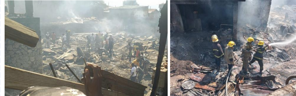
Fire at Site Camp Zamor