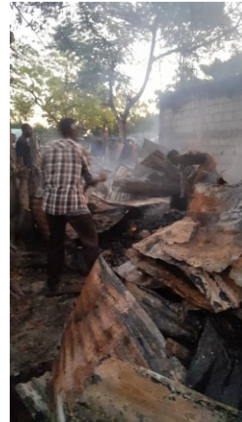
Fire on the site Saint-Monfort