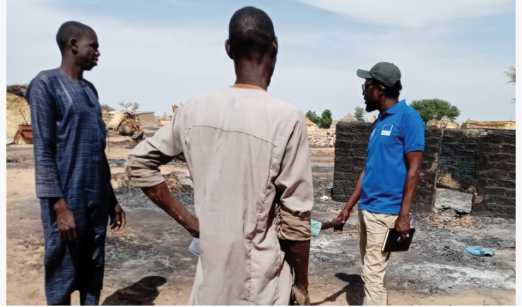
Aftermath of the fire outbreak at GSSSS Camp, Monguno, Borno State.

A fire broke out on 5 February 2023, at the Government Senior Science Secondary School (GSSSS) camp in the Monguno Local Government Area (LGA) and Bulabulin host community in Magumeri (LGA) of Borno state, causing damage and destruction to the shelters and possessions of many internally displaced persons (IDPs). Many people had lost their personal items which included food ration cards and biometric identification cards. There were no reported injuries or fatalities.