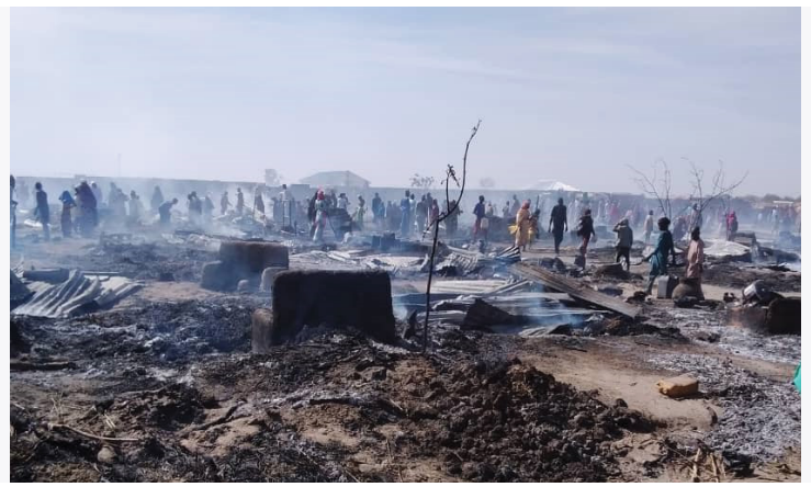
Aftermath of the fire outbreak at GSSSS Camp, Monguno, Borno State.

A fire broke out on 26 January 2023, at the Government Senior Science Secondary School Camp (GSSSS) in the Monguno Local Government Area (LGA) of Borno state, causing damage and destruction to the shelters and possessions of many Internally Displaced Persons (IDPs). Many people had lost their personal items which include food ration cards and biometric identification cards. There were no reported injuries or fatalities.