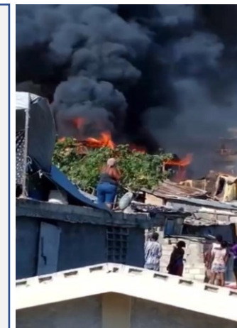
Fire at Fort-National