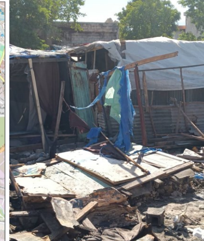
Fire at Airpot Ciné