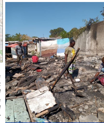
Fire at Airpot Ciné ©IOM Haïti / Fieddly Fils-Aimé 2023

This map is for illustration purposes only. The depiction and use of boundaries, geographic names and related data shown on maps and included in this report are not warranted to be error free nor do they imply judgment on the legal status of any territory, or any endorsement or acceptance of such boundaries by IOM.