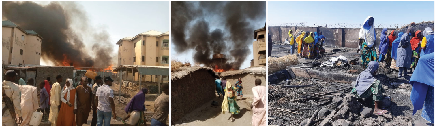
Pictures showing damaged shelter during and after the fire outbreak

A fire broke out on 12 January 2023, at the International Secondary School Camp in the Ngala Local Government Area (LGA) of Borno State, causing damage to and destroying the shelters and possessions of many Internally Displaced Persons (IDPs). Many personal items were lost in the fire, including food ration cards and biometric identification cards. There were no reported injuries or fatalities.