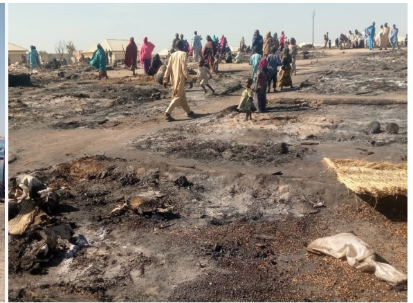
Pictures showing damaged shelter during and after the fire outbreak

On 29 November 2022, a fire outbreak was reported at Ajiri a host community location in Mafa LGA of Borno State. The fire damaged and destroyed shelters and belongings of numerous IDP households. Ajiri is one of the communities where IDPs from Farm Center Camp and Custom House 2 Camp (which were closed in September 2021) were relocated to by the state government.