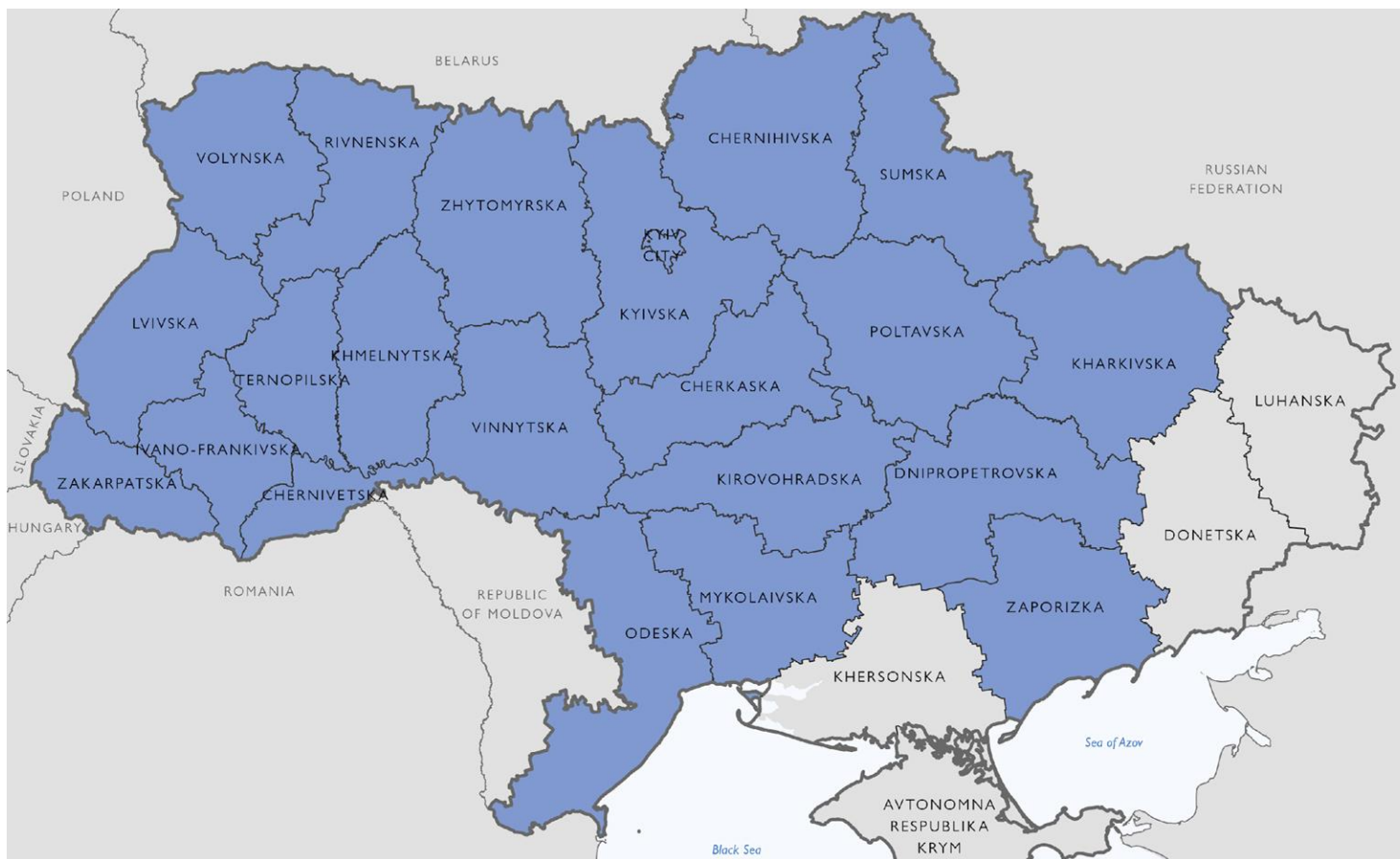
Map 1. DTM Round 12 Oblast level coverage: Kharkivska, Dnipropetrovska, Kyivska, Poltavska, Vinnytska, Zaporizka, Zakarpatska, Cherkaska, Lvivska, Odeska, Ivano-Frankivska, Khmelnytska, Mykolaivska, Kirovohradska, Ternopilka, Rivnenska, Chernihivska, Zhytomyrska, Chernivetska, Sumska, Volynska and Kyiv City.

For more insight on displacement trends, see IOM Ukraine's general population survey , which provides national and macro-region level estimates and insights on human mobility and needs using phone surveys and a randomized sampling approach. This area baseline reports complements the general population survey by highlighting the distribution of internally displaced population within oblasts at the raion level.