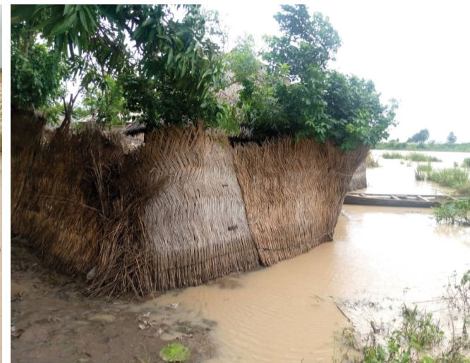
Flooded areas in Anguwan Maikano, Shelleng LGA