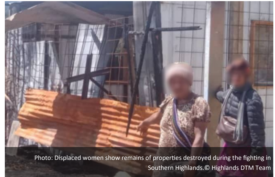
Photo: Displaced women show remains of properties destroyed during the fighting in Southern Highlands.

EDUCATION: Education is disrupted in several communities and children are not attending school. Additional information will be provided as it becomes available.