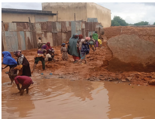
Flooded areas In Babut, Potiskum LGA.