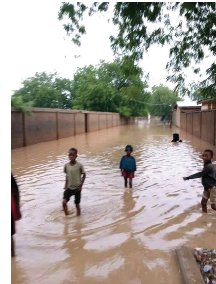
Flooded areas in Anguwar area in Asheikri Ward, Geidam LGA