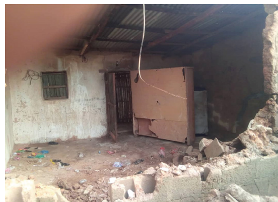
Damaged structure in Yan Kanwa Ramin Kasa ward Potiskum LGA.