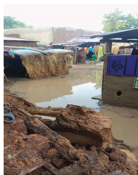
Flooded areas in Garin Zarami in Hausari Ward, Geidam LGA