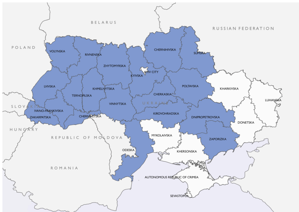
Map 1. DTM Round 7 Oblast level coverage in Kyivska, Dnipropetrovska, Poltavka, Vinnytska, Zakarpatska, Cherkaska, Lvivska, Khmelnytska, Ivano-Frankivska, Ternopilka, Odeska, Kirovohradka, Chernivetska, Zhytomyrska, Chernihivska, Zaporizka, Volynska, Rivnenska and Sumska oblasts.

For more insights on displacement trends in Ukraine see IOM Ukraine's general population survey which provides national and macro-region level estimates and insights on human mobility and needs using phone surveys and a randomized sampling approach. This area baseline report complements the general population survey by highlighting the distribution of internally displaced population within oblasts at the hromada level.