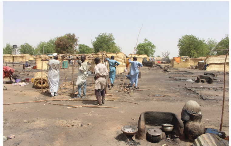
Residents of Muna El Badawy Camp rebuilding the damaged shelter after the fire outbreak

On 28 March 2022, a fire outbreak was reported at Muna El Badawy Camp in Jere LGA of Borno State. The fire damaged and destroyed shelters and belongings of numerous IDP households.