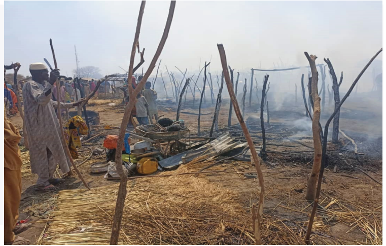
Residents of Muna El Badawy Camp assessing the damages after the fire outbreak

On 02 March 2022, a fire outbreak was reported at Muna El Badawy Camp in Jere LGA of Borno State. This is only two weeks since the last incident. The fire damaged and destroyed shelters and belongings of numerous IDP households.