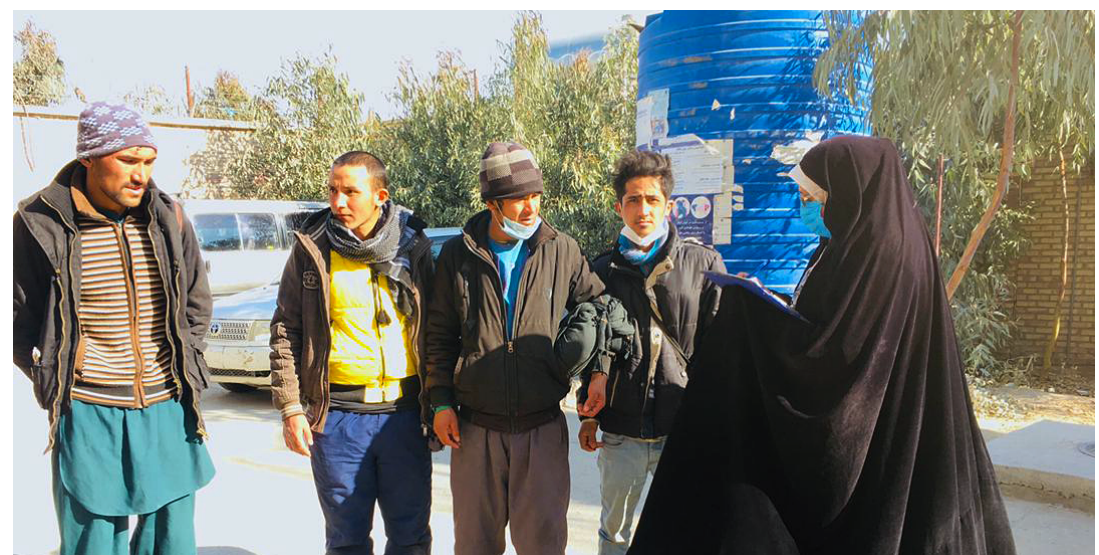
DTM collects data and reports on population flows and the status of border crossings through its PoE and Flow Monitoring activities, like here at Zaranj - Milak.

DTM focal points operating near the PoEs reach out to key informants, biweekly to collect comprehensive data, including the following attributes: movement restrictions; operational status; population flows; affected populations; risk communication and community engagement (RCCE); infection, prevention and control (IPC); presence of border health staff; disease surveillance and health referral systems; and border staff health & safety.