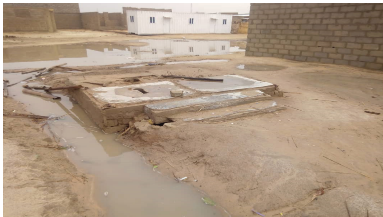
Pictures taken at the site showing damaged shelters and flooded latrines.