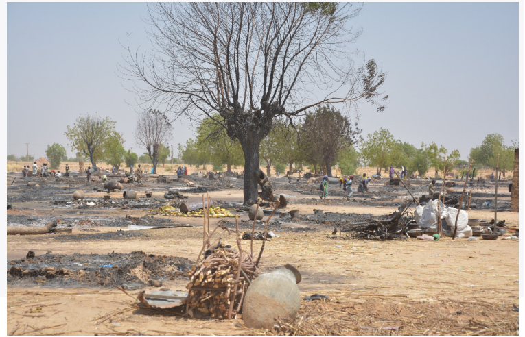
Residents of Gongolong Kareram Camp assessing the damages after the fire outbreak

On 16 April 2021 at 2:00PM, just five days since the last fire outbreak, another fire was recorded at Gongolong Kareram Camp that reportedly destroyed shelters and belongings of numerous IDP households.