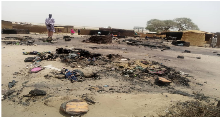
Affected area in Kuya Primary School camp after fire outbreak