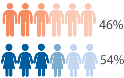
MOST NEEDED ASSISTANCE (FIG. 2)