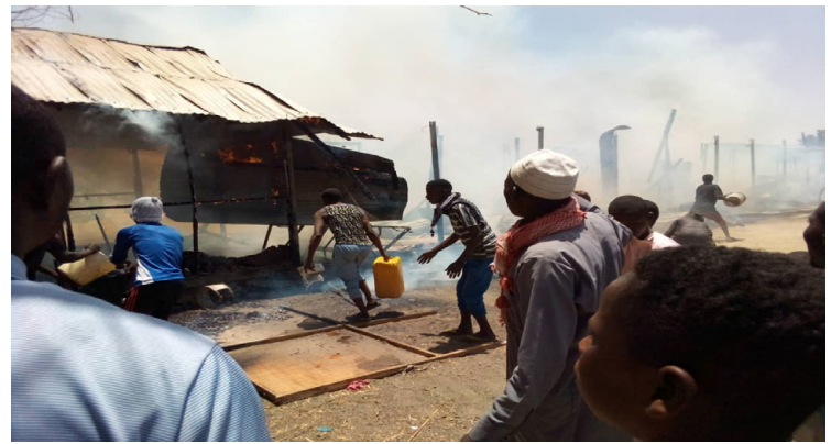
Residents of Fulatari Host Community putting out the fire