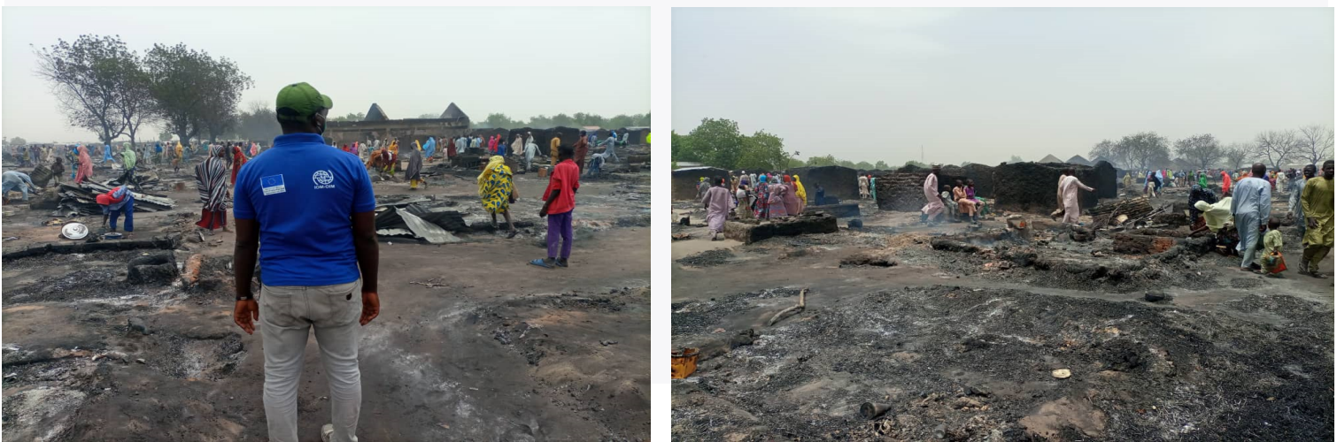
Residents of GGSS Camp assessing the damages after the fire outbreak

As a result of the fire outbreaks, the most needed assistance is shelter, as reported by 55% of the respondents, followed by NFIs (30%) and food (15%).