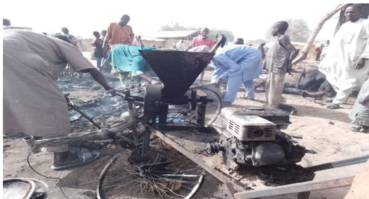
Residents of Waterboard Camp assessing the damage to means of livelihood after the fire outbreak