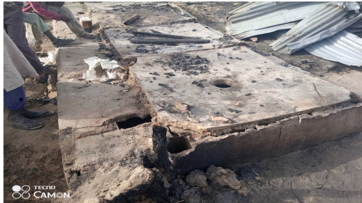
Residents of GGSS Camp assessing the damage to toilet facility after the fire outbreak