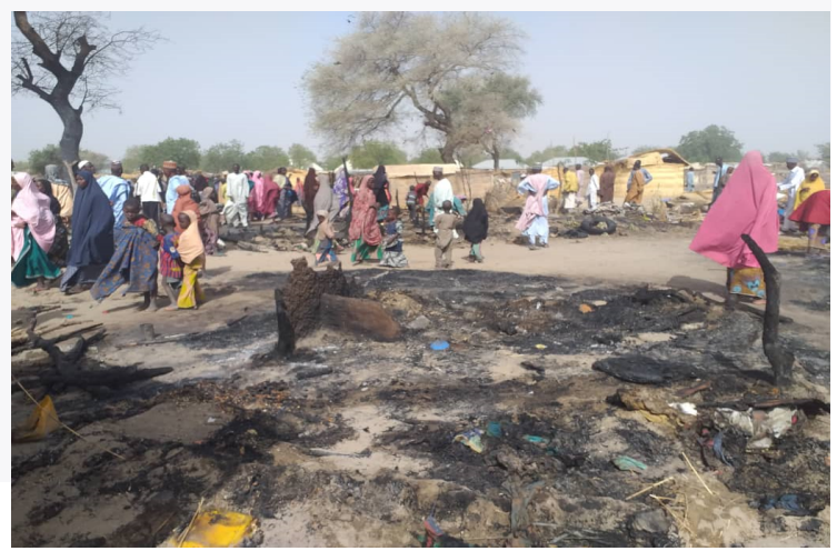
Residents of Waterboard Camp assessing the damages after the fire outbreak