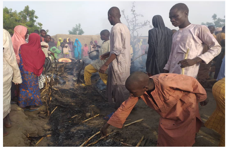
Residents of Kuya Primary School Camp assessing the damages after the fire outbreak

On 18 March 2021 at about 4:50PM, a fire outbreak at Kuya Primary School Camp destroyed shelters and belongings of numerous IDP households.