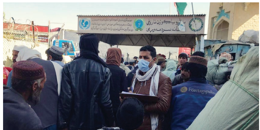
DTM collects data and reports on population flows and the status of border crossings through its PoE and Flow Monitoring activities, like here at Spin boldak - Chaman.

DTM focal points operating near the PoEs reach out to key informants, biweekly to collect comprehensive data, including the following attributes: movement restrictions; operational status; population flows; affected populations; risk communication and community engagement (RCCE); infection, prevention and control (IPC); presence of border health staff; disease surveillance and health referral systems; and border staff health & safety.