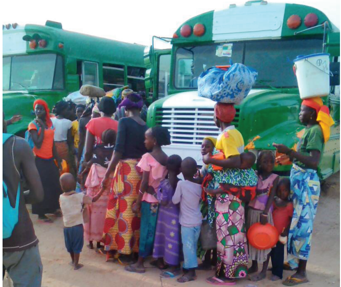
Families queuing to board the bus to Pulka

87 households, 234 individuals arrived at Mubi transit camp on Saturday 20 May from Minawawu Camp in Cameroon. The movement was voluntary. They are in need of shelter and food. Trigger: Voluntary relocation Movement: Spontaneous DTM & ETT Cumulative: IDPs = 11,514