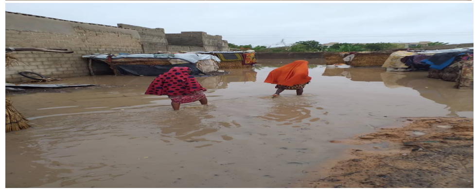
Pictures taken at the site showing damaged shelters and flooded areas.