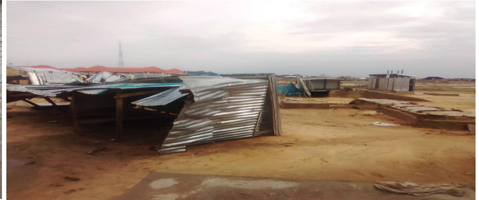
Pictures taken at the site showing damaged toilets and flooded areas.