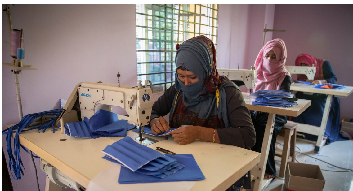
As part of a livelihoods project, migrant beneficiaries in Bangladesh produce cloth-made washable masks for distribution to those providing essential services to the public during COVID-19.