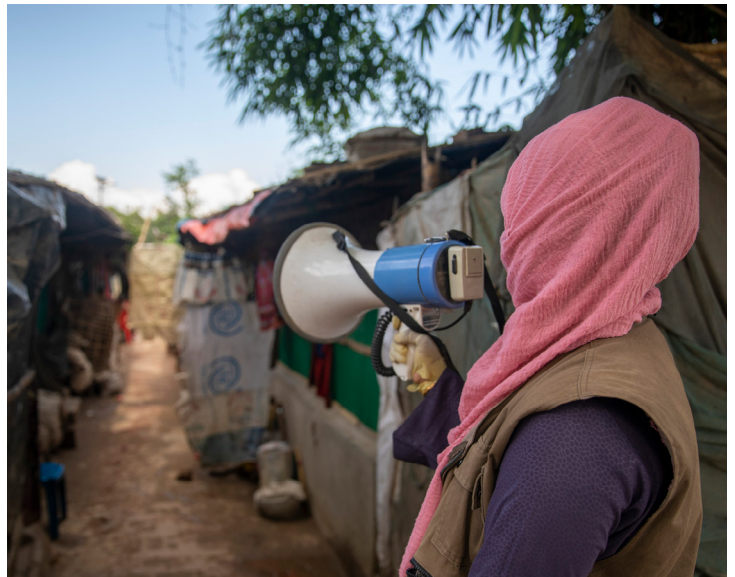
IOM volunteers use megaphones to disseminate key COVID-19, hygiene best practice and mental health and psychosocial support messages to those facing increased mobility restrictions in the Rohingya settlements.

Received by IOM for its Global Strategic Preparedness and Response Plan for Coronavirus 2019 2