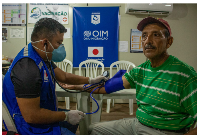
IOM conducts health promotion and immunization activities in Brazil.