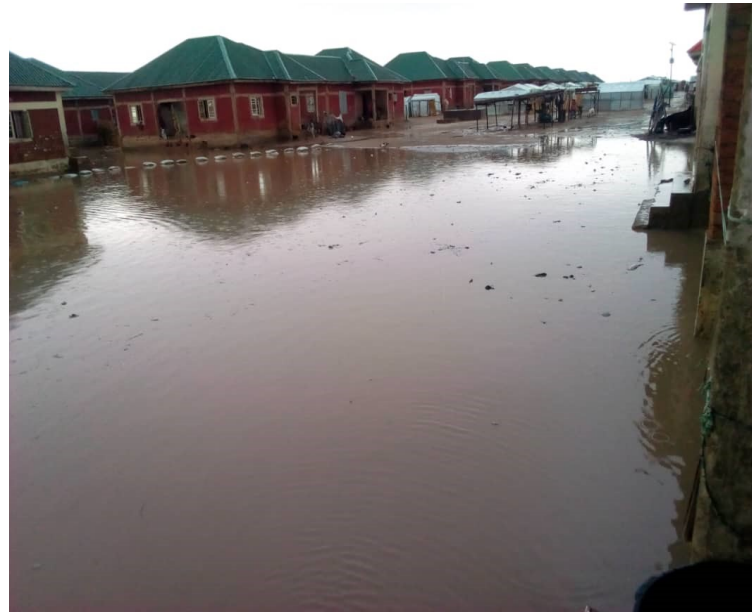
Teacher's Village Camp after the Heavy Rainfall 21 June

With the onset of the rainy season in Nigeria's conflict-affected northeastern State of Borno, varying degrees of damages are expected to infrastructures (self-made and constructed) in camps and camp-like settings. This is so because the rains are more often than not accompanied by very high winds and have been known to cause serious damage to properties.