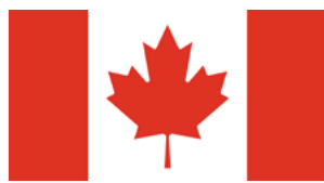
Government of Canada