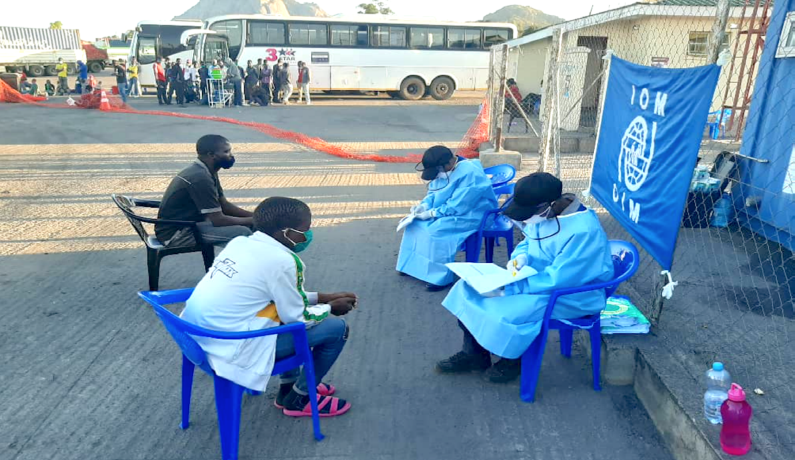
IOM Malawi facilitated reception of 1,150 returnees from South Africa, United Kingdom and Zimbabwe, and provided them with face masks, alcohol-based hand sanitizers and onward transportation for most vulnerable returnees