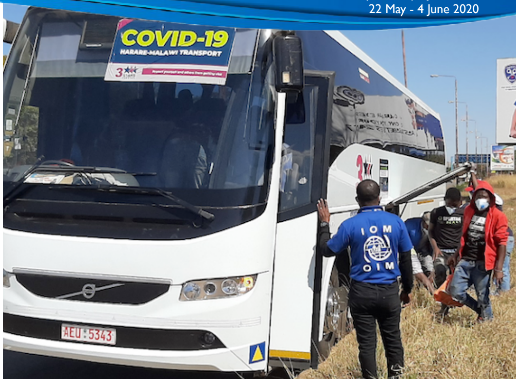
IOM Zimbabwe facilitated the voluntary return of over 90 Malawian Migrants from Zimbabwe to Malawi

*SOURCE: WHO COVID-19 Situation Dashboard: https://covid19.who.int/ , 4 June 2020