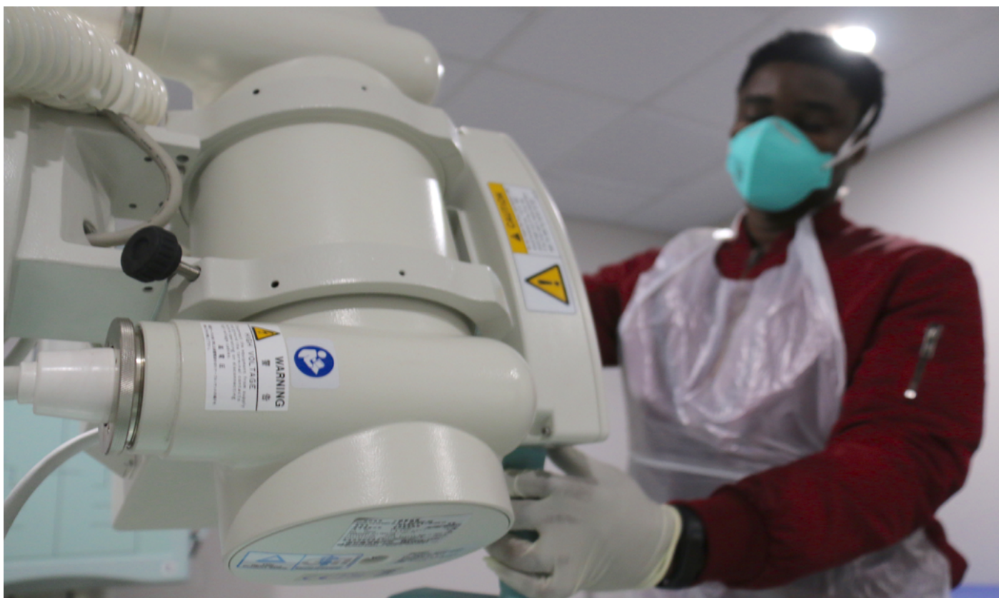
An IOM South Africa Medical staff operates the clinic's X-Ray machine for pre-departure assessment. In South Africa, plans are under way to use IOM's medical unit Laboratory as COVID-19 testing centre to complement government's efforts to contain the virus