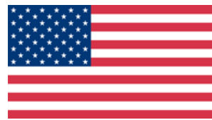
Government of the United States of America