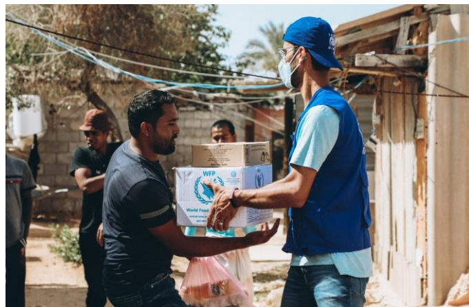
IOM working together with WFP to distribute Ready to Eat kits for migrants in Tripoli, Libya

In Sudan , IOM provided emergency food support to 100 vulnerable Ethiopian and Nigerian migrants in Gedaref, together with COVID-19 awareness raising messages.