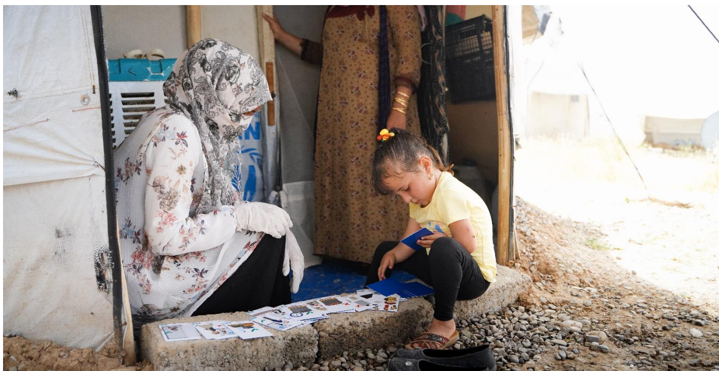
IOM teams conducted hygiene promotion on COVID-19 in one of the IDP camps in Ninewa, Iraq