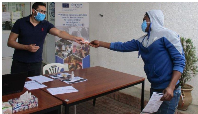
IOM in Morocco continues to provide support to those in vulnerable situations by distributing vouchers for general household and food items.

In Yemen , activities are being carried out across 11 governorates, with 908 hygiene promotion sessions conducted and 710 kits distributed. IOM also produced a video highlighting essential COVID-19 prevention measures to be played during one of the most popular Yemeni TV shows during the next reporting period. To reach as many Yemenis as possible, IOM is also developing a social media campaign with engaging videos and graphics highlighting RCCE key messages.