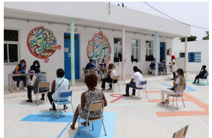
One of the distribution sites to assist migrants in Cartage, Tunis.

These testimonies highlight just some examples of the difficulties that many migrants continue to face, often alone and without family or community support. In addition to those working in Tunisia, international students are also confronted with unique challenges in the face of the COVID-19 pandemic. With many international money