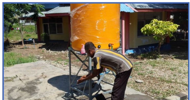
Installation of a handwashing station in Kupang, Indonesia.