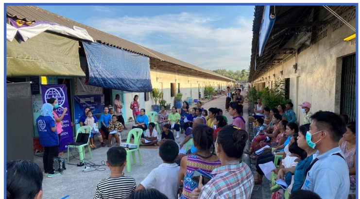
IOM and public health officials conduct an outreach activity for the migrant community in Ranong, Thailand.