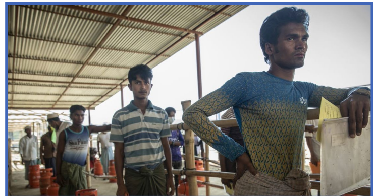
Fuel distribution in line with social distancing measures in Cox's Bazar, Bangladesh.

Due to movement restrictions, IOM Bangladesh is making use of public audio forums and radio programs to communicate hygiene and health-related messages. Having observed group gatherings at certain refugee camps in Cox's Bazar, IOM launched a rapid assessment to determine where and why social distancing is not being consistently observed. IOM is working with community leaders in these camps to encourage behavioral change in line with the guidance provided by health partners. Furthermore, 26 IOM staff have received Rapid Investigation Team (RIT) training by WHO.