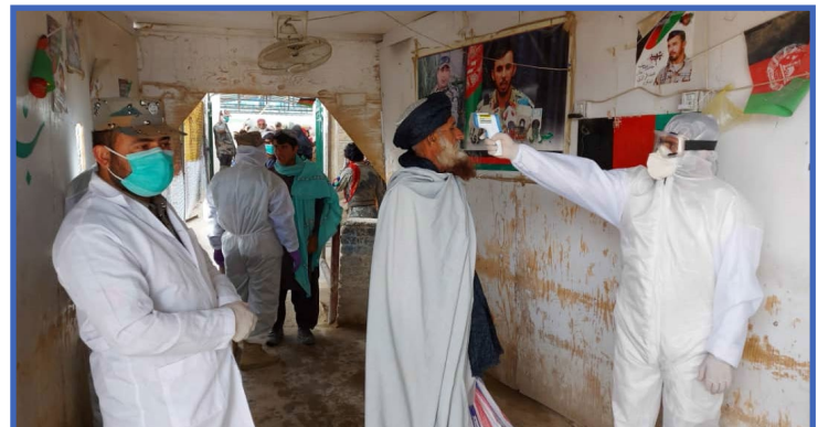
Temperature screening at the Spin-Boldak Chaman border in Afghanistan.