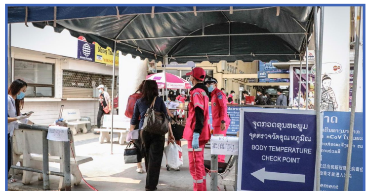
Health screening at Thailand/Lao PDR border.