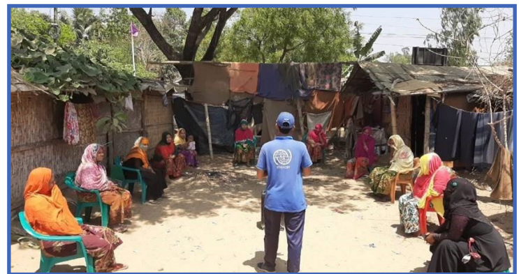
Beneficiaries attending an awareness-raising program in Bangladesh.

IOM Myanmar distributed pandemic supplies, including PPE sets, hands sanitizers, non-touch thermometers, sterilizers and waste disposal bags to Mon, Kayin, Kachin and Rakhine State Health Departments.