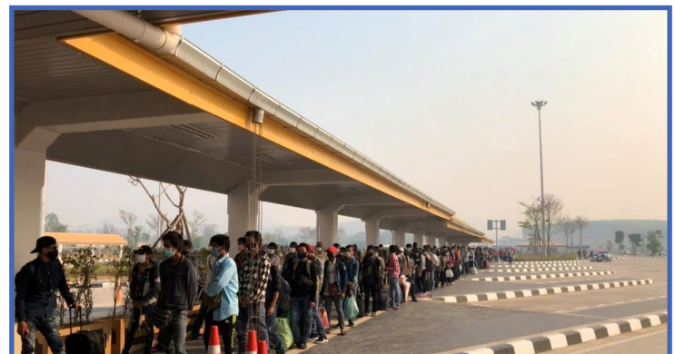
Migrants waiting to cross at the Thai-Myanmar Friendship Bridge.