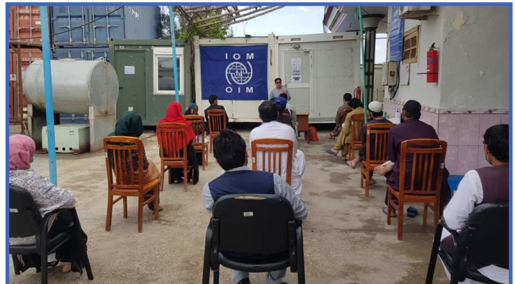
IOM staff conducting a COVID-19 awareness session in Kandahar, Afghanistan.

On 9 April, UNDRR, IOM ROAP and the International Council of Voluntary Agencies co-hosted a webinar on “Reducing COVID-19 Vulnerability Amongst Displaced Populations and Migrants” with guest speakers from Afghanistan, Bangladesh and India.