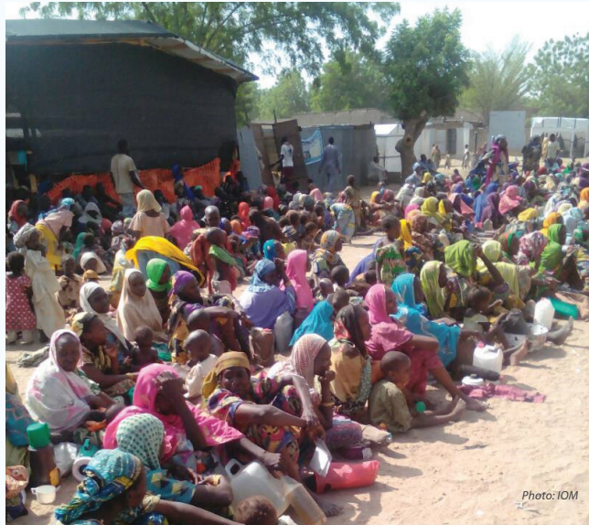
New arrivals: Women awaiting screening at Banki